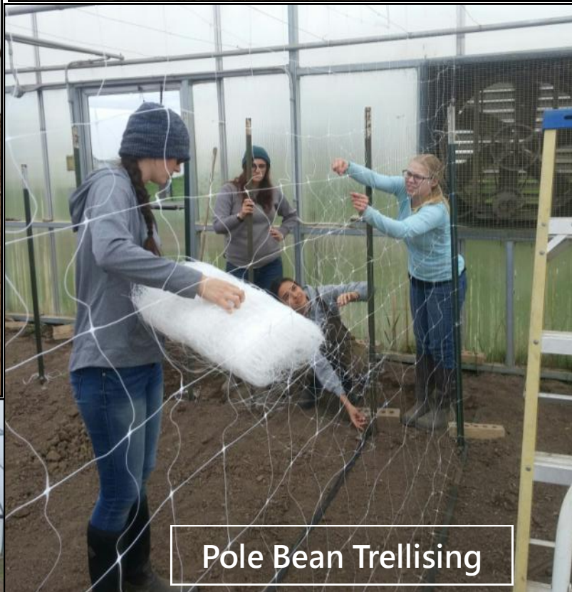
Pole Bean Trellising