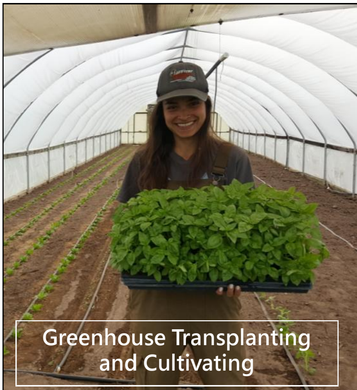
Greenhouse Transplanting and Cultivating